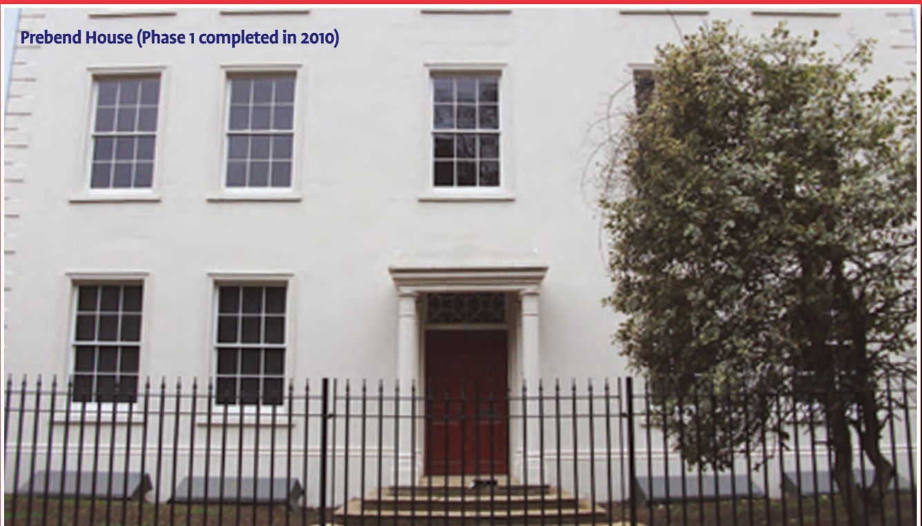
Prebend House (Phase 1 completed in 2010)